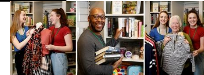
Volunteer in a charity